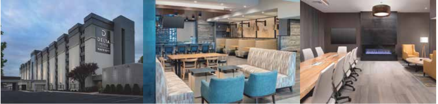
HOSTING HOTEL FOR THE 2024 GNRHS CONVENTION; DELTA HOTEL BY MARRIOTT IN EVERETT, WA.