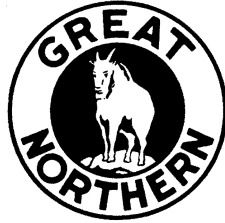
1922 to 1935